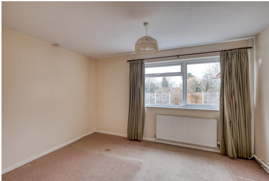
Chacewater Crescent, Worcester